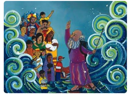
National Migration Week: January 8-14